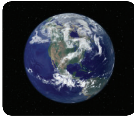
Figure 2 Two fluids essential for life—water and air—cover and surround our planet.

We live in a world full of fluids, but not all fluids are liquids. Fluids are substances that flow, so gases are fluids, too. The atmosphere that surrounds Earth (Figure 2) is a fluid that is crucial to all life forms on the planet. Unfortunately, we harm the atmosphere when we release dangerous gases into the air from cars, factories, and landfill sites (Figure 3).