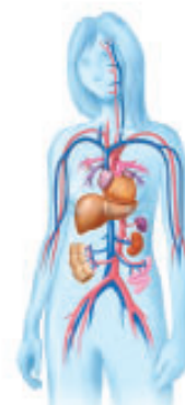
Figure 4 Blood travels throughout the human body via arteries (red) and veins (blue).

Several systems within your body make, use, or move some of the fluids listed in Table 2. These systems include the circulatory system, the respiratory system, and the urinary system. Sometimes technology is needed to maintain the health of our bodies' fluid systems.