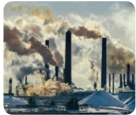
Figure 3 Human activity has an impact on the health of fluids.