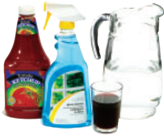
Figure 1 All homes contain many different fluids.

fluids: materials that have no fixed shape and are free to flow, such as liquids and gases