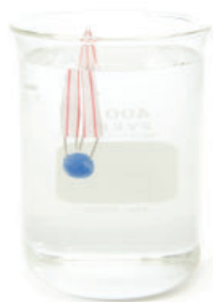
Figure 7 Your diver should just float on the surface of the water.

Cartesian divers, submarines, and fish with swim bladders all demonstrate a common principle: objects that displace a greater volume of fluid are more buoyant than those that displace less fluid.