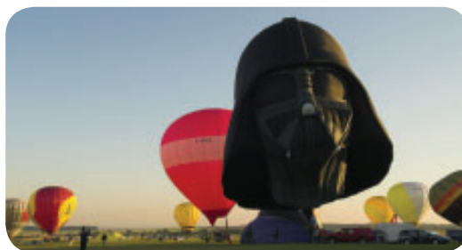
Figure 3 Designers must consider density and buoyancy when creating specialized hot air balloons.