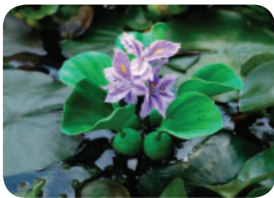
Figure 4 The rounded portions of the water hyacinth stem contain air, making this water plant less dense than the water it lives in.

swim bladder: a controllable, balloon-like chamber that allows fish to alter their buoyancy