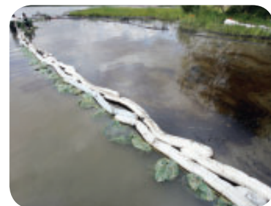
Figure 1 This floating boom has trapped most of the spilled oil.

However, the fact that oil is less dense than water is helpful in cleaning up oil spills. Floating booms are used to encircle oil spills on the surface of the water (Figure 1). Then, collection devices scoop, soak, or suck up much of the captured oil.