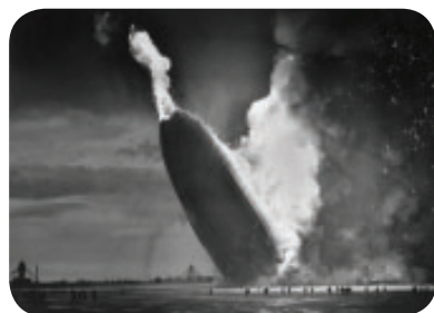
Figure 2 The Hindenburg disaster reduced the number of large air ships used for commercial transportation.